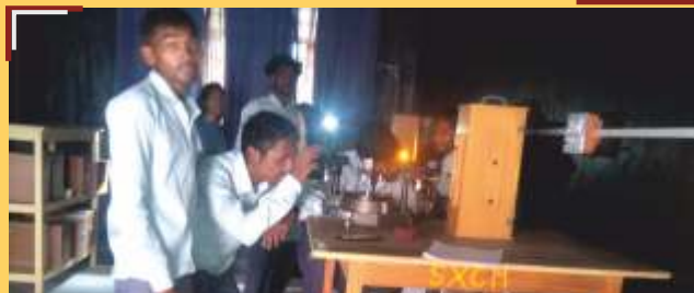
Research is to Think What Nobody else has Thought