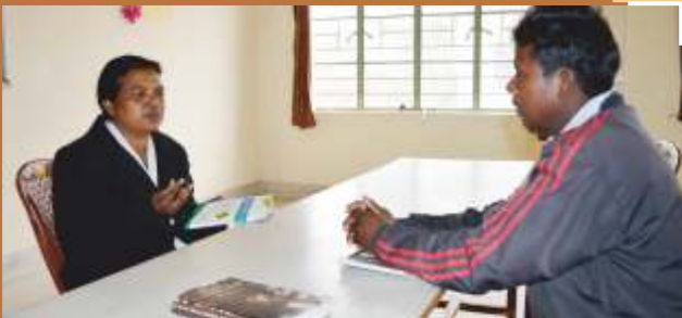
"Caring everyone is our passion"