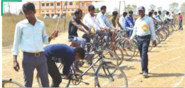
Slow Cycle Race