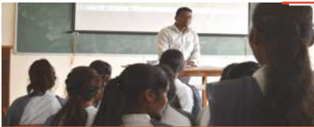
Orientation Program for Student Council Members