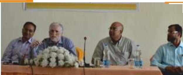
NAAC Team Addressing the Staff