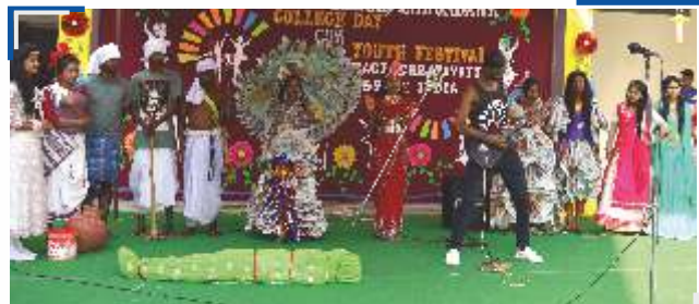
Fancy Dress Competition – "Be Unique"