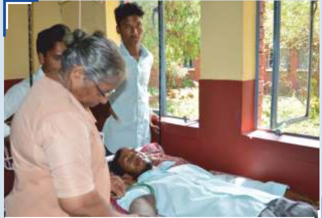
“Donate Blood , Save life”