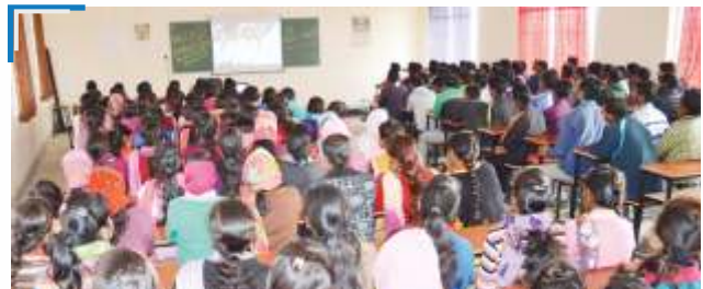
Video Presentation on You and Your Rights