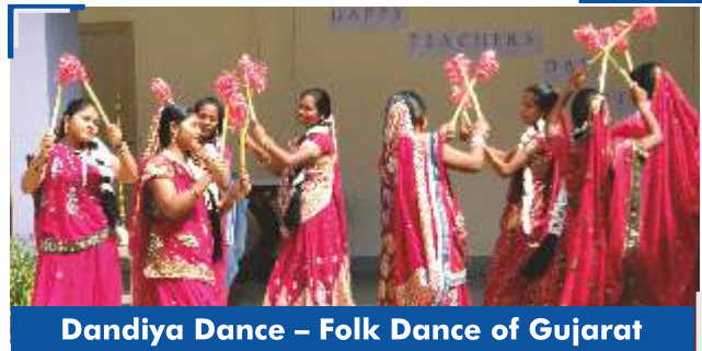
Dandiya Dance – Folk Dance of Gujarat