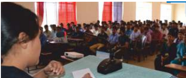
Workshop on Human Rights