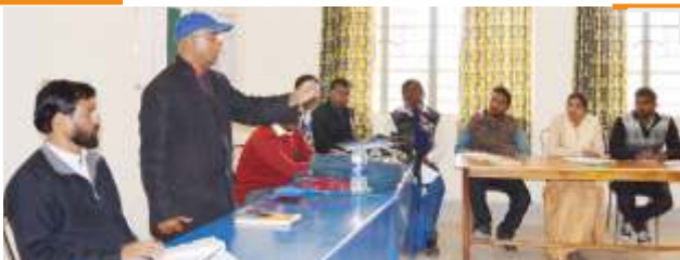
Interaction and Discussion with the IQAC Members