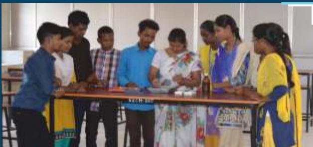
Innovation: The Ability to See Change as an Opportunity