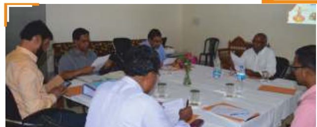
Meeting with the GB Members