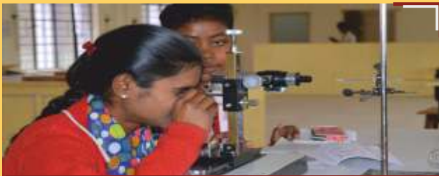
Way to Discovery