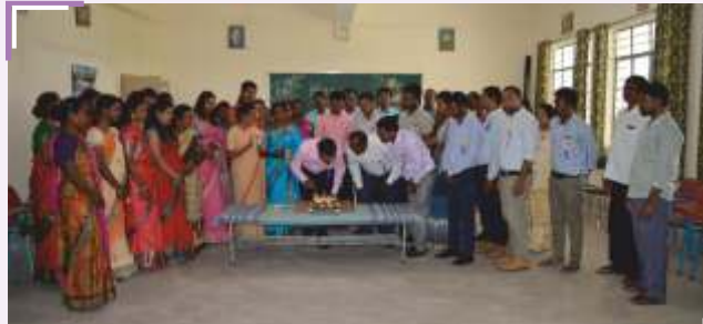
Celebrating Team Spirit