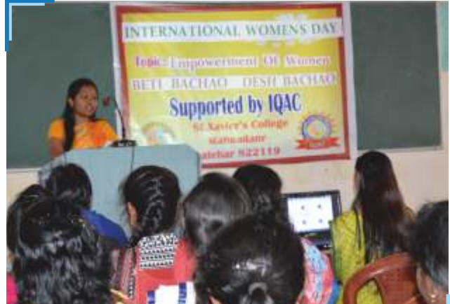
Educate Women – Empowerment of Women