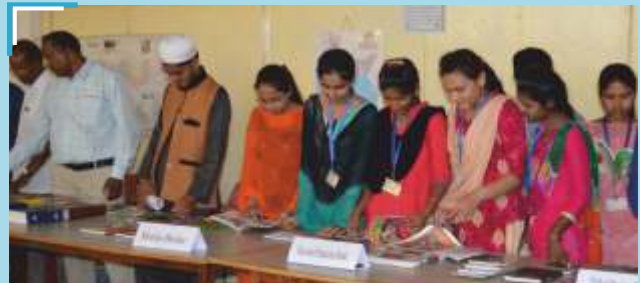
Book Fair at Institute Level