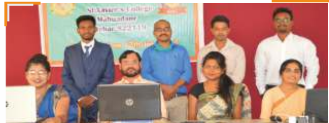
Conduction of an International Webinar by IQAC