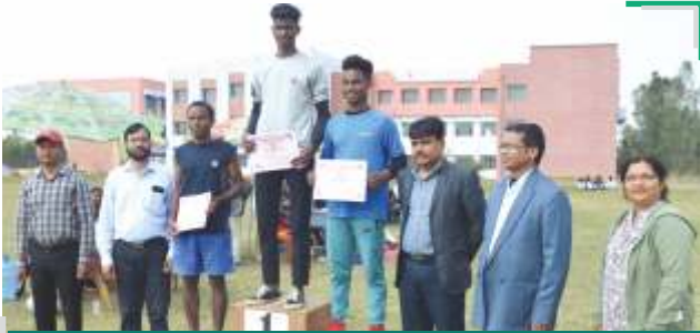
We are the Winners