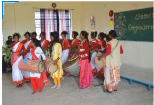
Women in Forefront