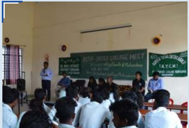
AICUF Inter College Meet, SXCM and SXCR