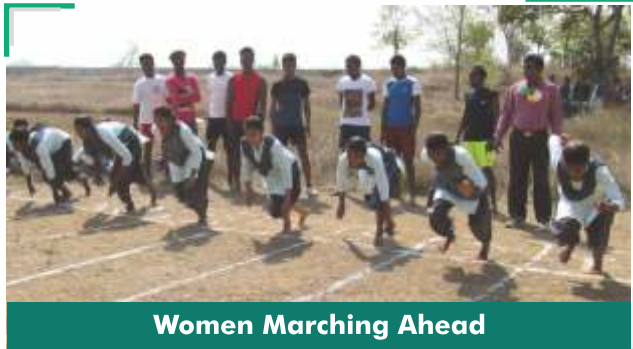
Women Marching Ahead