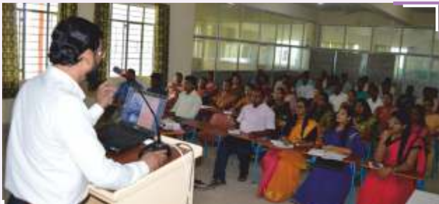
Faculty Development Program