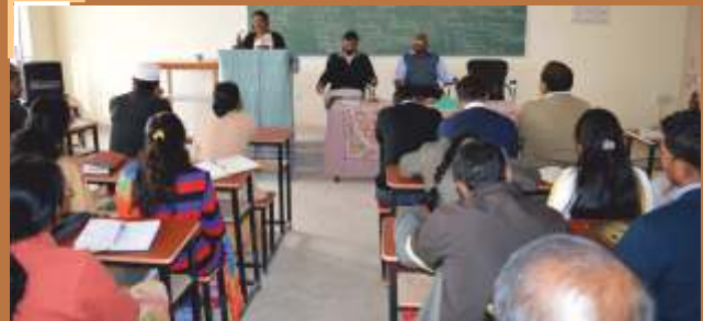
Workshop on developing a positive attitude towards life