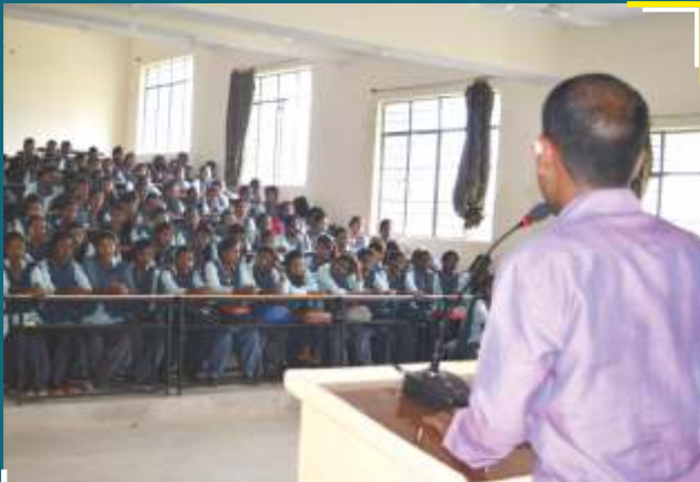
"Believe You Can and You are Halfway There"