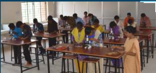
"Innovation: The Only Way to Win"