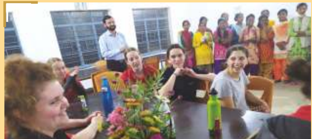
Memorable Moments with Australian Guests at Hostel