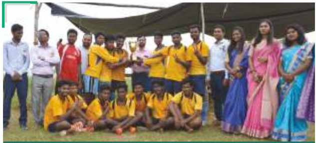
We are the Champions