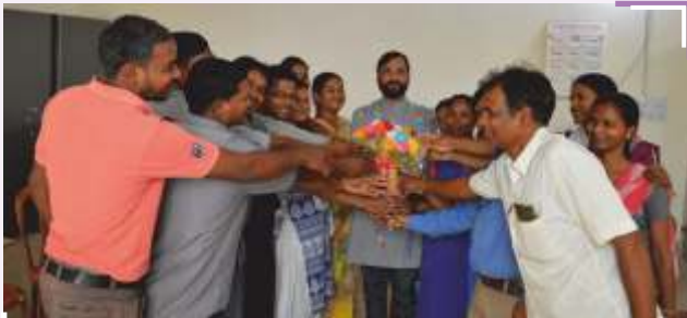
Expression of Gratitude