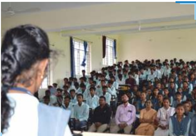
"Every Woman is a Hero"