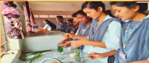
Collection and Preservation of Plant Specimens