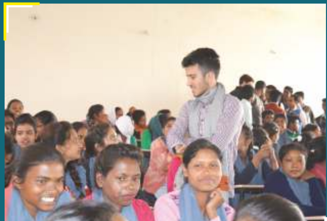
Interaction: the Best Way to Broaden One's Mind