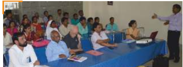
FDP by Registrar of St. Xavier's College, Ranchi (Autonomous)