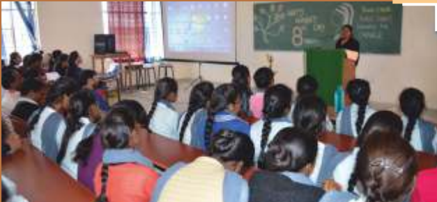
"Educate women, empower the nation"