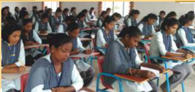
Self Study Hour at the College Hostel