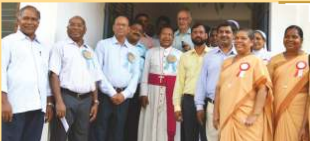
Inauguration of St. Xavier's College Girls' Hostel by Honorable VC of NUP