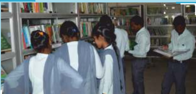
"Books: Treasures of Life"