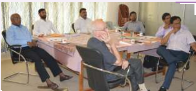
The Importance of Teamwork