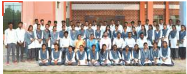
Students' Council Members with Council Facilitators