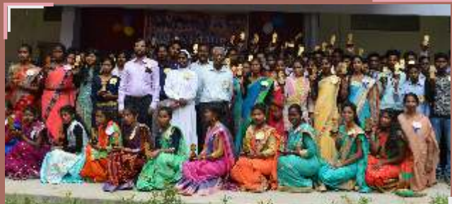
Old Guards with the Torchbearers