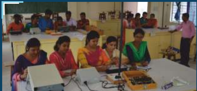
Creativity: Thought and Action