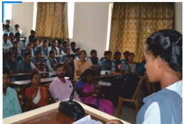
Say No to Gender Bias