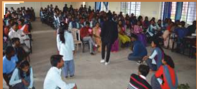
"Teach the next generation to care for women and children"