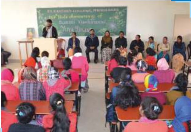
"Youth can Change the World"