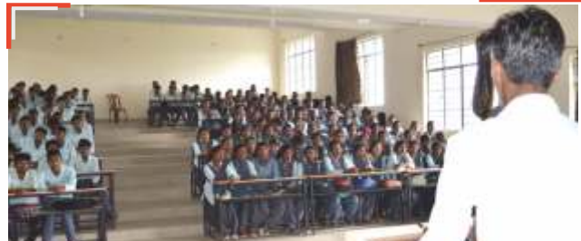
Address of the Students' Union President