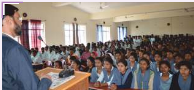
Workshop on Unity in Diversity