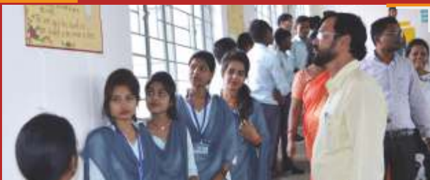
Poster making Competition on Gandhian Thoughts