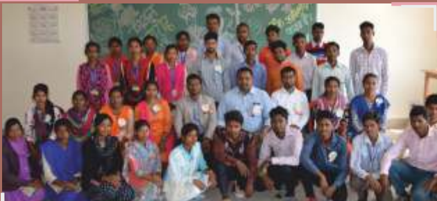
The Return of the Warriors