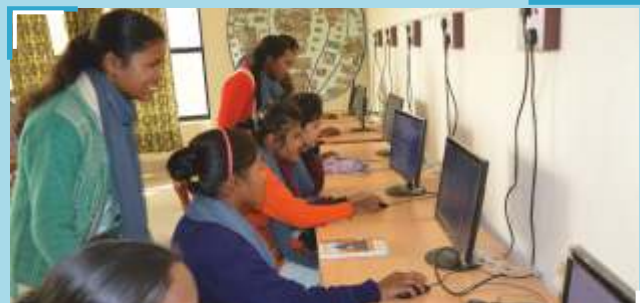
"E-LEARNING : Online Education"