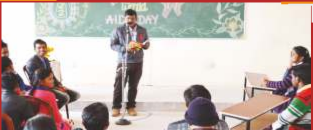
Awareness Program on AIDS and its Prevention