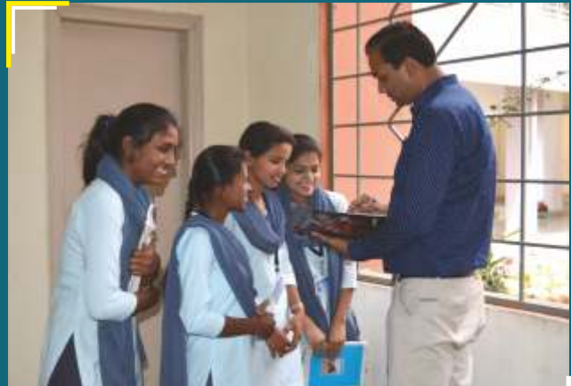
"Motivate People to Believe in Themselves"