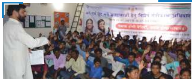
Strengthening girls' participation in democracy