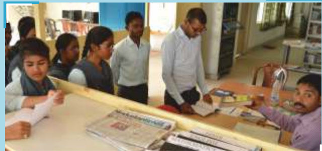
Library is a Tour Guide