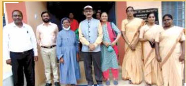
Honorable VC's Visit to Girls' Hostel