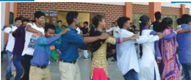
Celebrate Human Rights Day Everyday