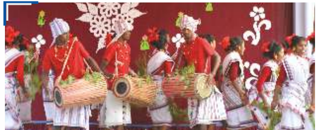
Tribal Chain Dance – Jharkhand Culture