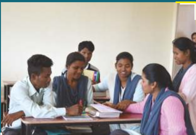
Discussion: A Way to Develop Critical Thinking