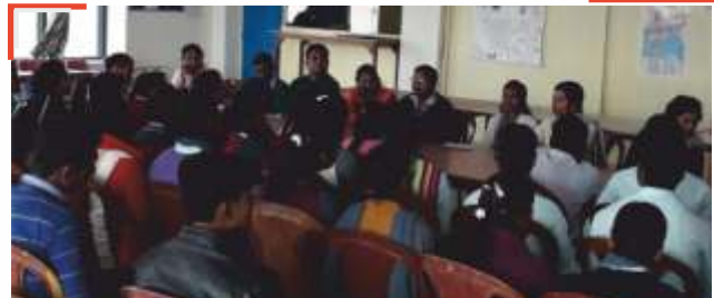
Students' Council Meeting