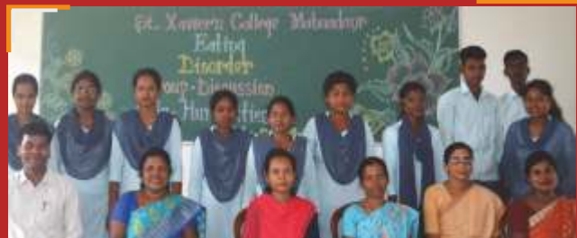
Group discussion on Eating Disorder