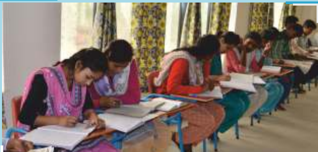
My Library, My Lifeline