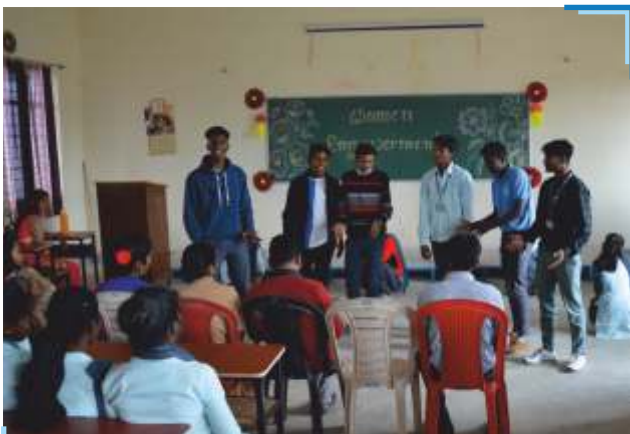
Empowerment of Women : Need of the Hour