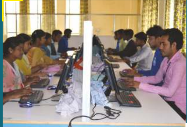
"Technology is Best when it brings People Together"