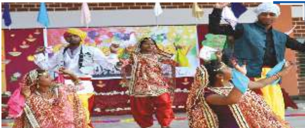
Bhangra: Traditional Folk Dance of Punjab