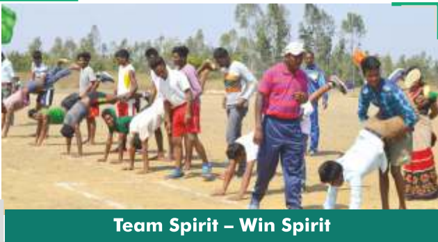
Team Spirit – Win Spirit