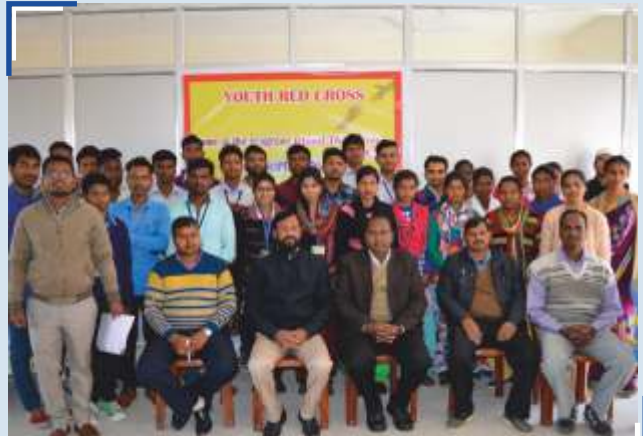
“Serve society, help one another”