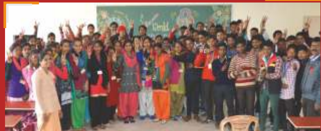
World Aids Day Celebration