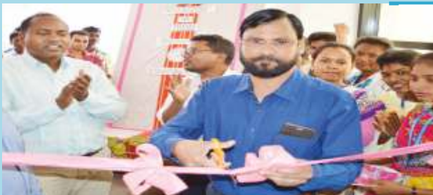
Inauguration of the Gateway to Knowledge

Library stands as the backbone and the most important asset of the college for all the members of the college and outsiders as well. Therefore to monitor all the functioning and development of the library, a committee called Library advisory committee has been formed. This committee has been acting as the driving force for effective functioning, improvement and development of the college for many years. All developmental activities of the library and the execution of action plans are closely monitored by the committee.