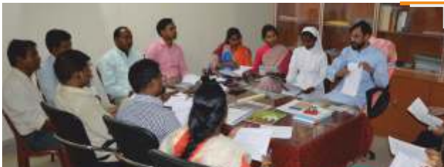
Meeting with IQAC Members and HoDs