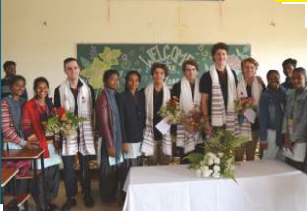
Opportunities bring forth Changes