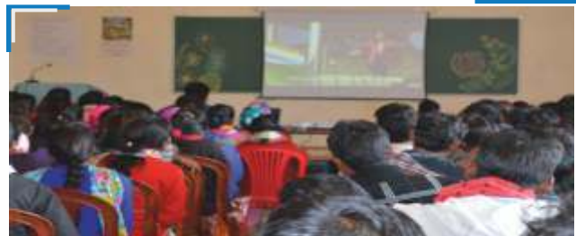
Raise your voice for the welfare of society