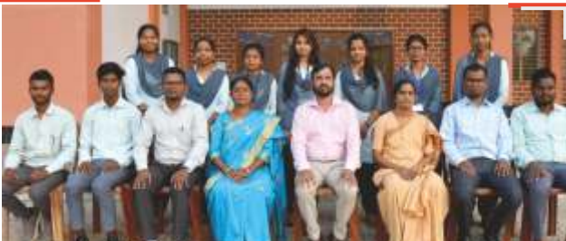
Student Council Members with the Principal