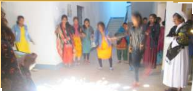
Diwali Celebration at Hostel