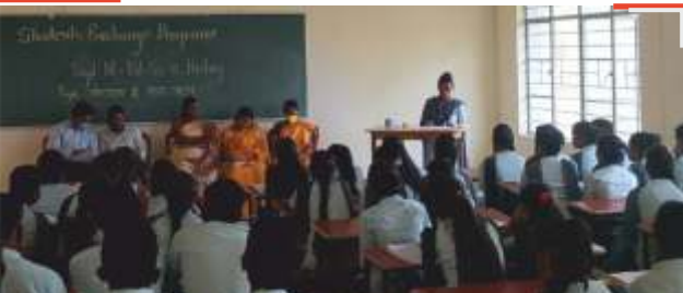
Students Exchange Program