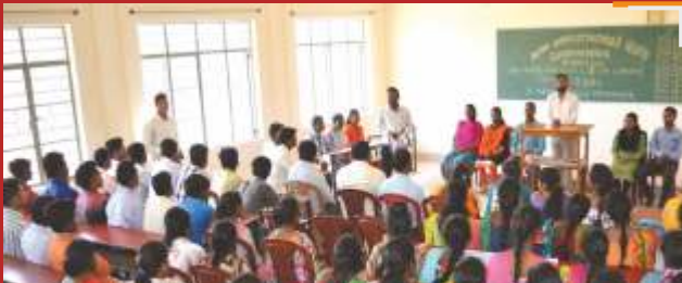
Inter Departmental Quiz