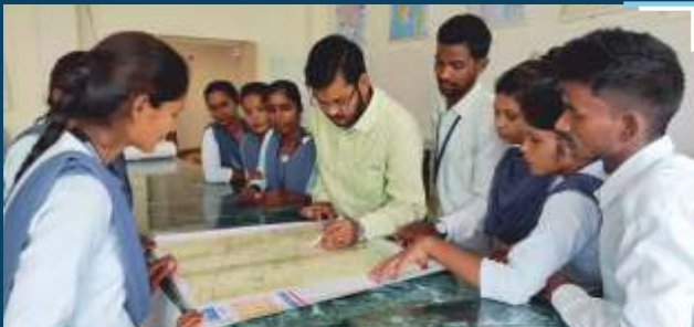
A Meeting Point of Ambition and Imagination

Physics is a complex structure of concepts, hypothesis, theories and observations that are interrelated in such a way that it is often difficult to separate inference based on theories from direct observations based primarily on laboratory experiments. Students understand that experimental evidence is the basis of our knowledge of the laws of physics and that physics is not merely a collection of equations and text book problems. All of the laws of physics are expression of experimentally observed phenomena in nature. In the laboratory there is an opportunity to observe and discover those phenomena directly. Laboratory work reinforces the students' understanding of fundamental concepts.