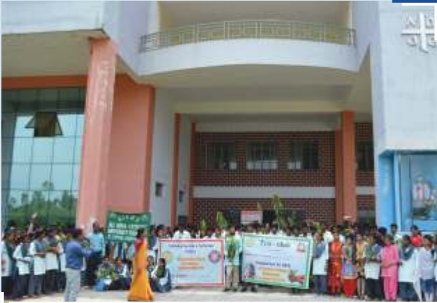
Plantation – Save Earth