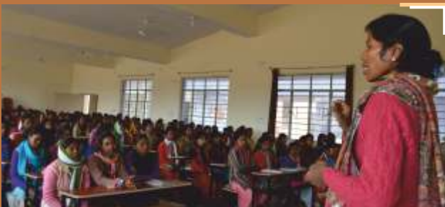
"Gender inequality: Burning human issue"