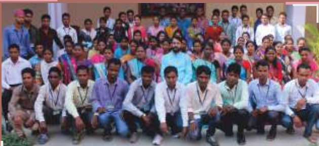
The Future is Bright