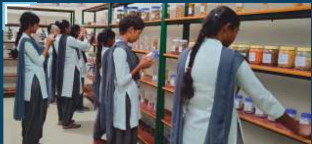
Herbaria: A Space of Rare Species