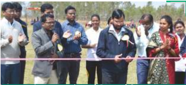
Inauguration of Annual Sports Day Celebration