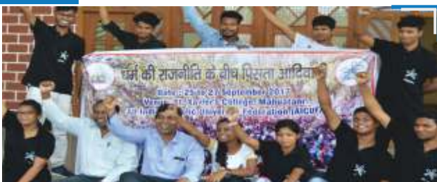
No one shall be deprived of his/her rights