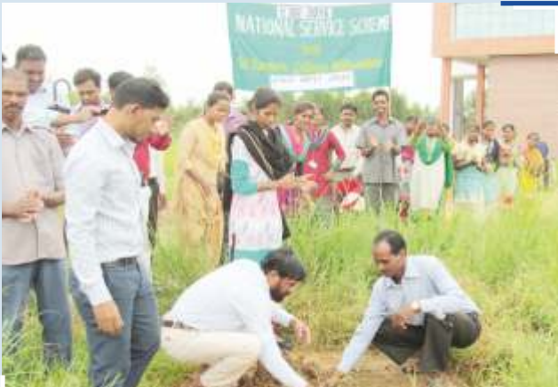
Plant a tree and make the environment pollution free