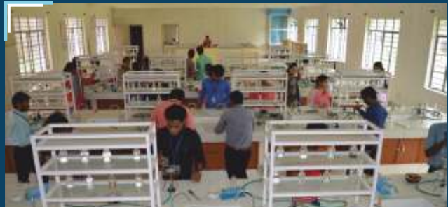
"There is No Innovation and Creativity without Failure"