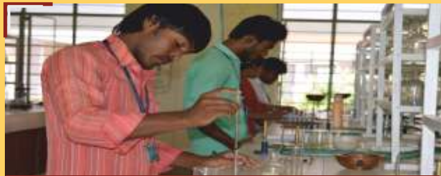
Way to Create New Knowledge