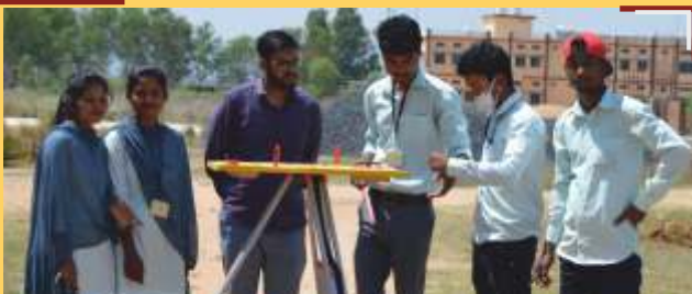
"No Research without Action, No Action without Research"