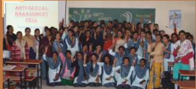
Bring forth women to realize the dream of equality