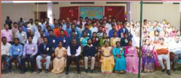
Once a Xaverian is Always a Xaverian