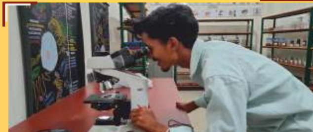
Desire and Excitement for New Discoveries