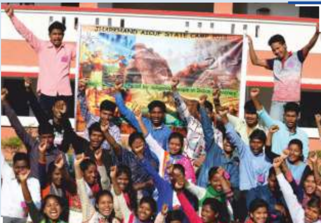
AICUF State Camp on Challenges faced by Indigenous People in Indian Democracy