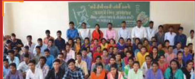
Gandhiji's 150th Birth Anniversary Celebration